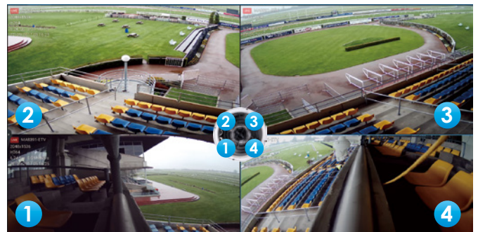
Multiple sensors, Adjustable views